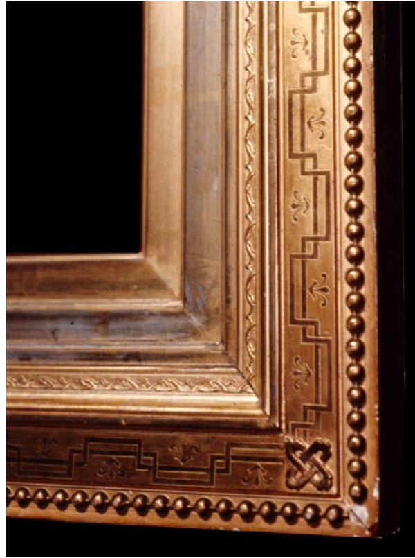
Figure 12. Incised, gilded, and selectively burnished flat bands were popular on high style frames during the 1860s to 1880s (the main outer profile has been removed).

The proportion of oil to water gilding on frames increased with the introduction of more compo, but water gilding continued to be the choice for the plain matte or burnished surfaces between the compo/plaster bands, and for burnished highlights on forward features of the compo/plaster. Plain small moldings between the bands of ornament, such as fillet, torus, and hollow, were usually burnished water gilding, and flats were usually matte water gilding. In all cases of combined oil and water gilding it was practical to complete the water gilding before the oil gilding since the brushed oil size could be neatly lapped onto the edges of the water gilding.