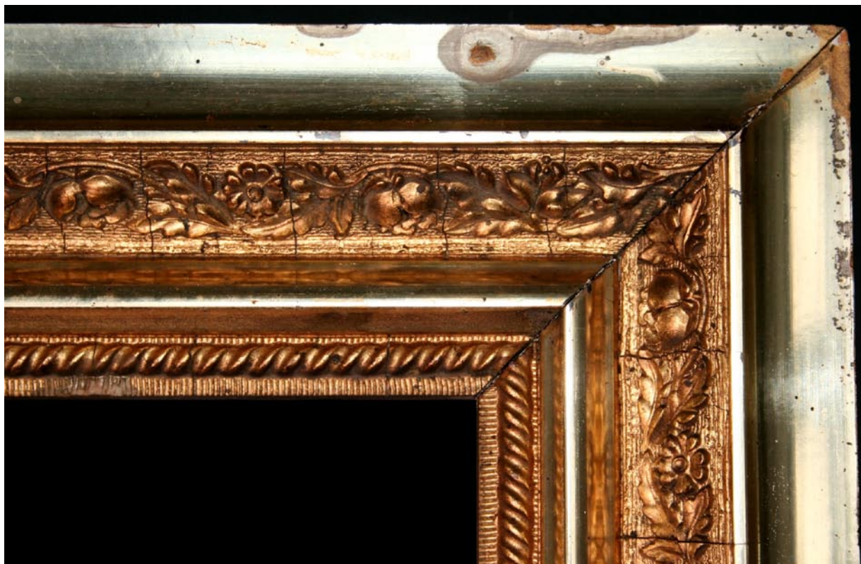
Figure 13. Mecca gilding of faded yellow varnish on silver leaf on an outside ovolo, with oxidized silver where the varnish is thin or broken.

mid-century, and brighter red pigmentation was used in the late century.