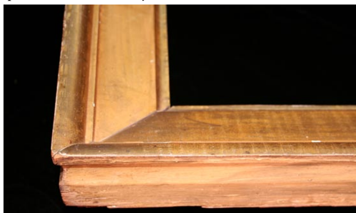
Figure 3. Front view of fig. 2. The frame is water gilded and has an ovolo top molding, beveled main profile, cavetto sight edge, and a hollow in the yellow painted perpendicular back edge.