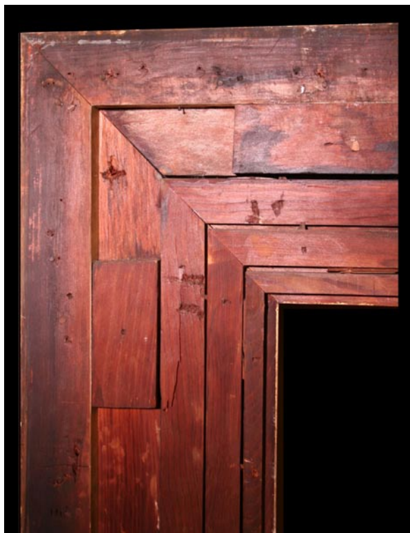
Figure 4. Back view of a four section frame with a box section recess in the main outer profile, and supporting glue blocks.

section of sight edge. A slip is an insert at the sight edge, and usually a later addition.