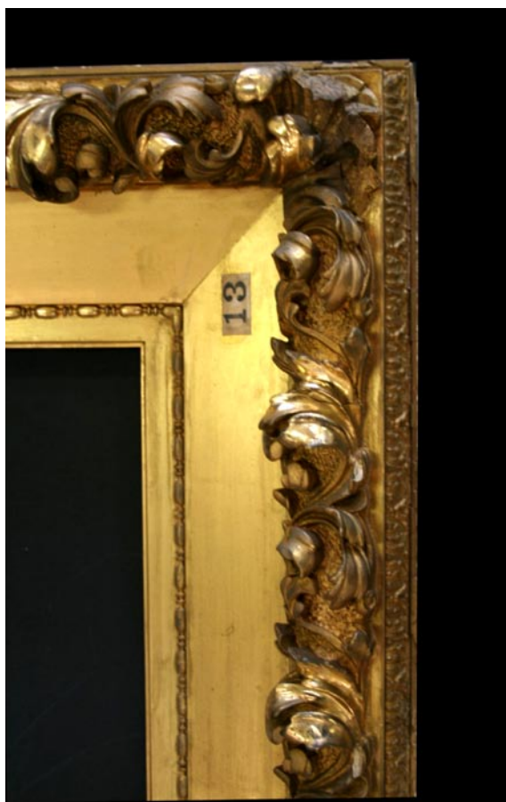
Figure 11. Lively late-century plaster ornament on a top molding (the corner leaf turnover is missing), and a small inside band of compo bead-and-reel.