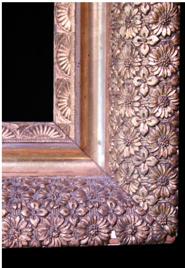
Figure 7. Discontinuous design at the miter of late-century machine pressed ornament.

its history and technology have been described by Thornton (1985) and Wetherall (1991). Compo ornament was much faster to produce than carved wood and it was also more stable as a substrate for gilding, since wood in the American climate is prone to movement. Compo was pressed into rigid molds of reverse carved wood, molded sulfur, or resin. Pressed compo ornament continues to be available today, and the dough-like material is easily prepared (Thornton 1985).