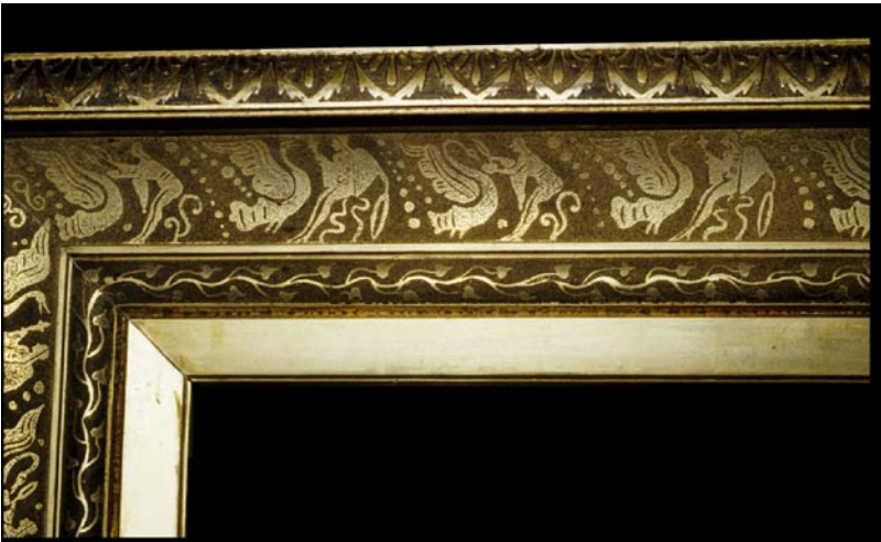
Figure 10. Stylized wave and foliate sand patterns were used in the third quarter.

was only achieved by raising parts from the substrate or backing it with putty fills. Compo is characterized by its pale brown raw umber-like color, its thickness varying from 1/16" to 1", the absence of undercutting, and the development of proportional shrinkage cracks on drying.