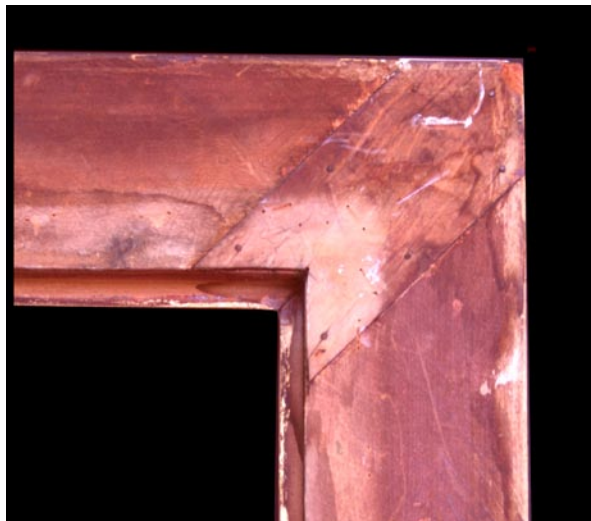
Figure 6. The distinctive Newcomb-Macklin corner joint of thin plywood inserted in the back of the miter.