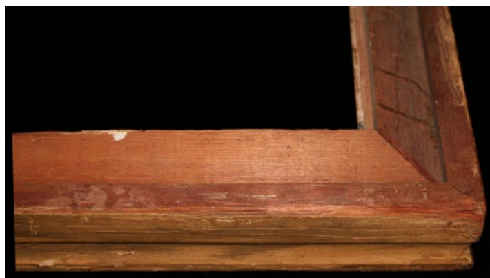
Figure 2. Back view of a sloped main profile edge glued to a painted perpendicular outer edge, a popular form in the second quarter of the 19th century.

Corners, centers, and sub-centers refer to enriched ornament at those sites, and piercing describes openings through the decoration. A mat is the liner that modifies the frame's opening to elliptical or round, and a liner is the removable inner