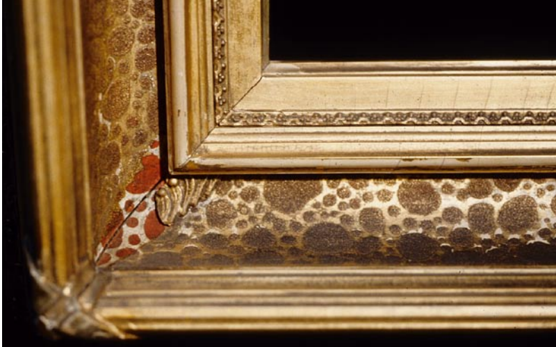
Figure 9. Stenciled rustic patterns of rocks (repeated patches) initially filled the main cove after about 1840.