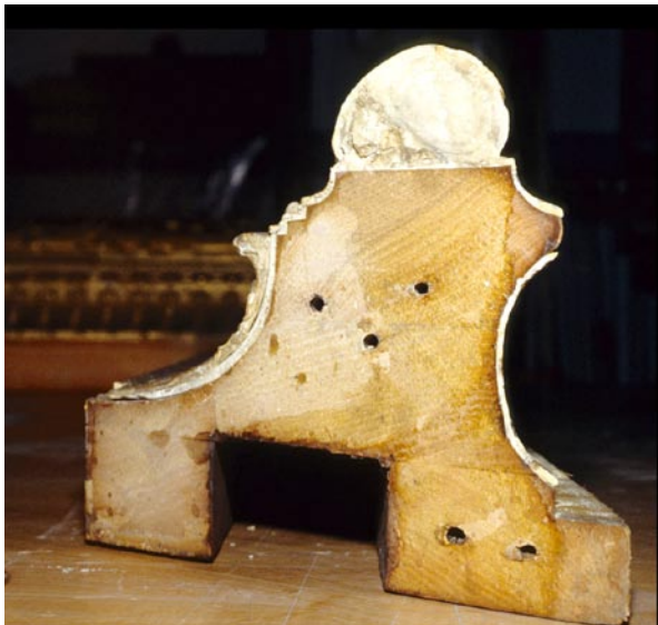
Figure 5. An opened miter corner of an outer profile with a box section back recess and laminated four-part construction.

cluded two-section rails, square (boxed) recessed backs with supporting glue blocks, and lengthwise glued laminations for deeper rails. In the second half-century three and four concentric section rails achieved greater widths, while rail laminations, box recessed backs, and supporting glue blocks all remained common. The concentric sections of multiple section rails were gilded before assembly, seated in rebates, and fastened with angled nails in the back (fig. 4). Most reform styles (aesthetic movement, arts and crafts, etc.) after 1865 reverted to simple single rail arrangements.