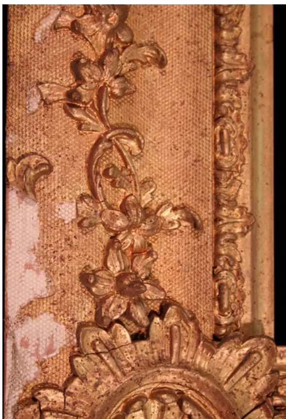
Figure 8. Oil-gilded tulle net as textural decoration. Sections of compo are missing and reveal the net beneath.

The form, placement and detail of compo ornament evolved in fashion during the century in conjunction with developing rail forms and gilded effects. Early compo was more globular, and later examples became finely detailed. Logical early placement was to cover the corner joinery, visually strengthening the joints, and then the next vacant space, the centers, were filled after about