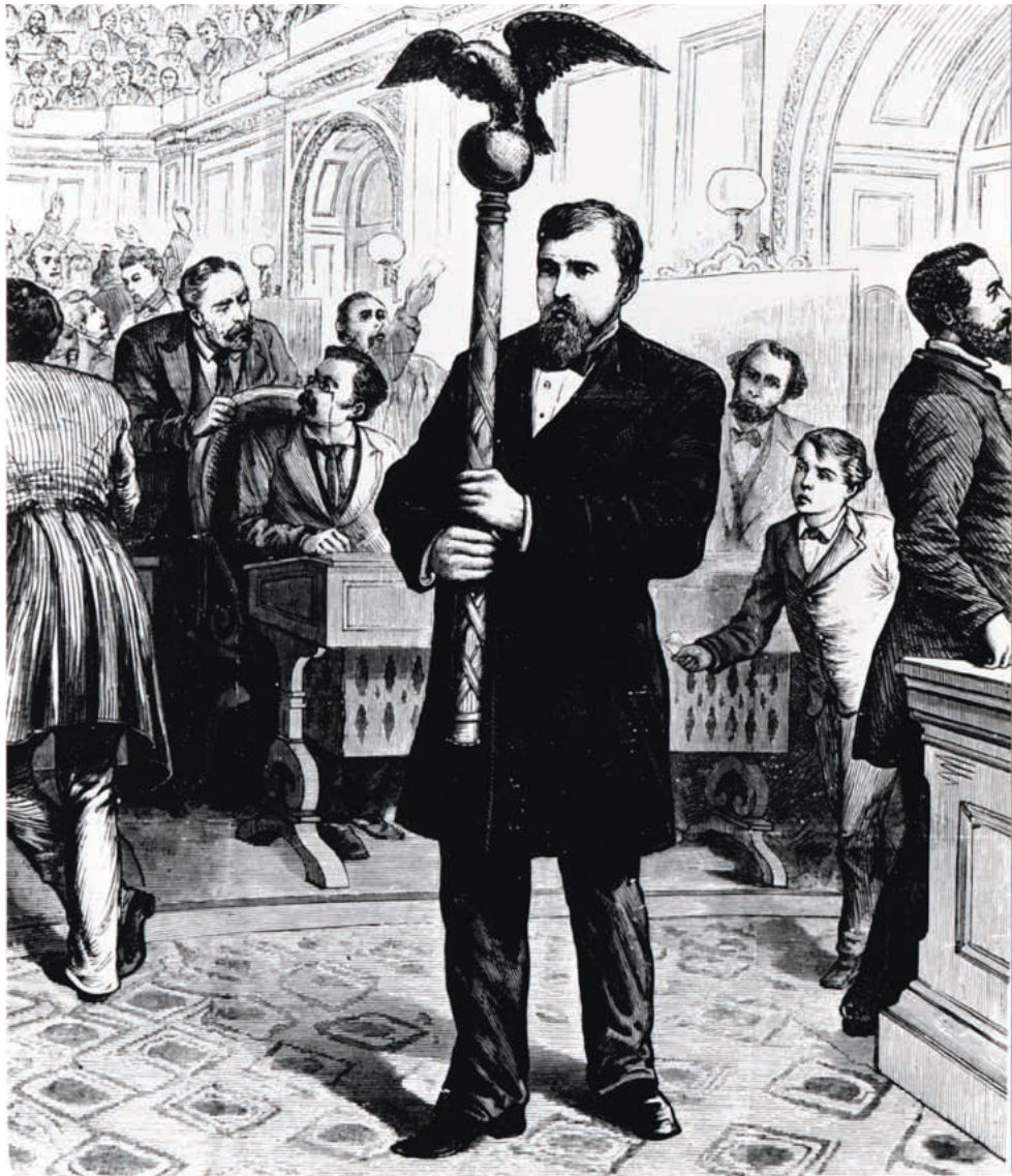
Figure 2. The mace being used to restore order on the House floor, January 31, 1877 [from the cover of Frank Leslie's Illustrated Newspaper 43 (Feb. 24, 1877)].