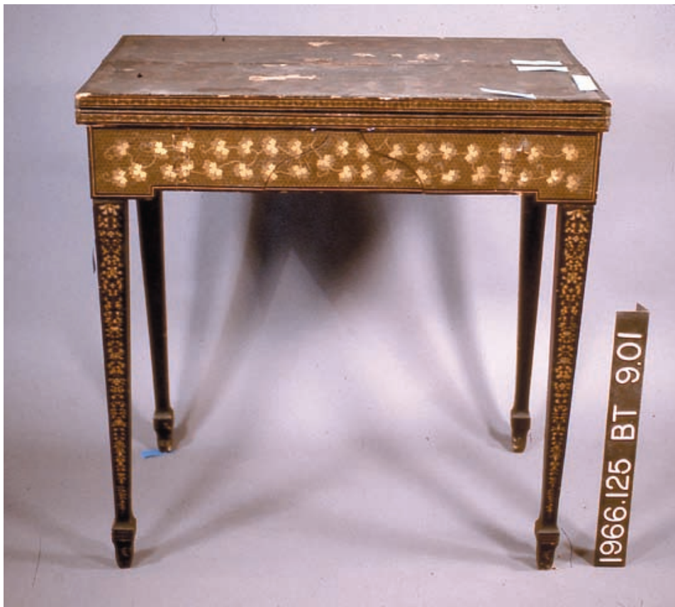
Figure 2. Export lacquer card table, c. 1800.