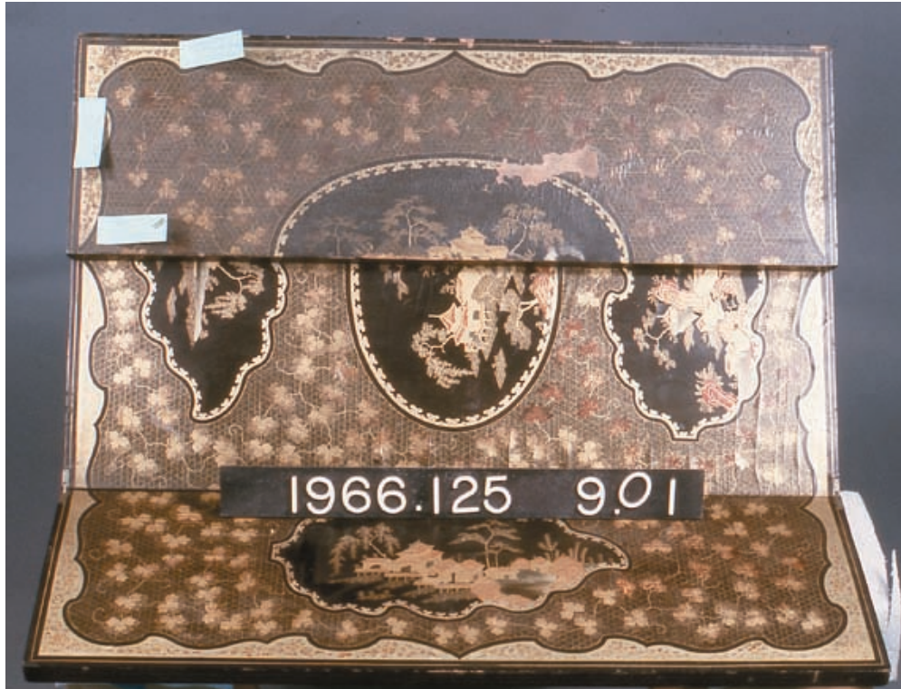
Figure 3. Contrast between exposed and protected lacquer surface.

immediately, will change the color and also dissolve the lacquer.