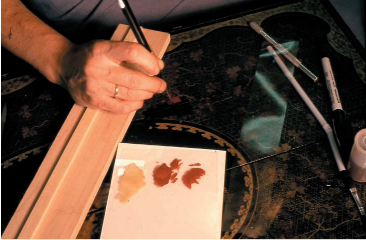
Figure 9. Sizing the missing decorative images with quick oil size.