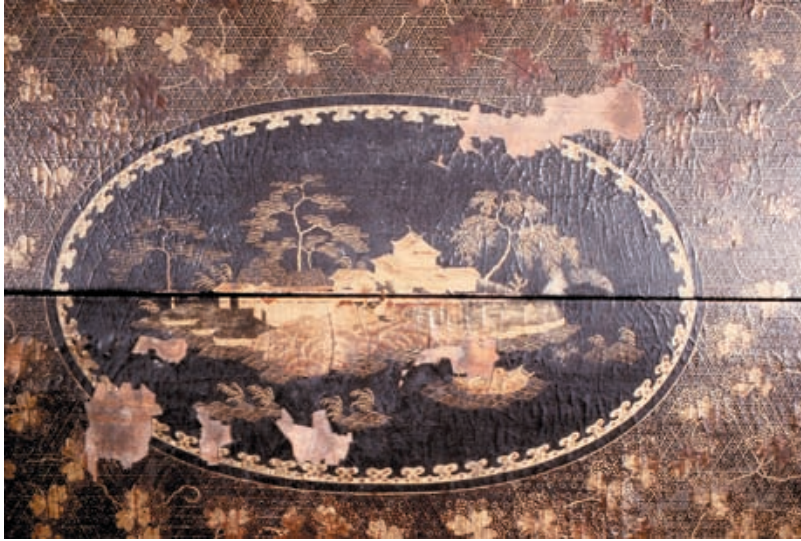
Figure 5. Detail of large losses on exposed top.