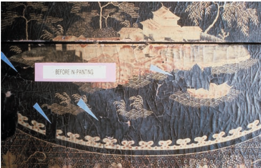
Figure 8. Toning background color of replacement lacquer before in-painting decoration.

orientation, and cut out with a back-bevel using a jeweler's saw. (fig. 7) The thickness of the cast was adjusted with coarse sandpaper. The fills were adhered with liquid hide glue, 8 and the small seam gaps filled with pigmented beeswax.