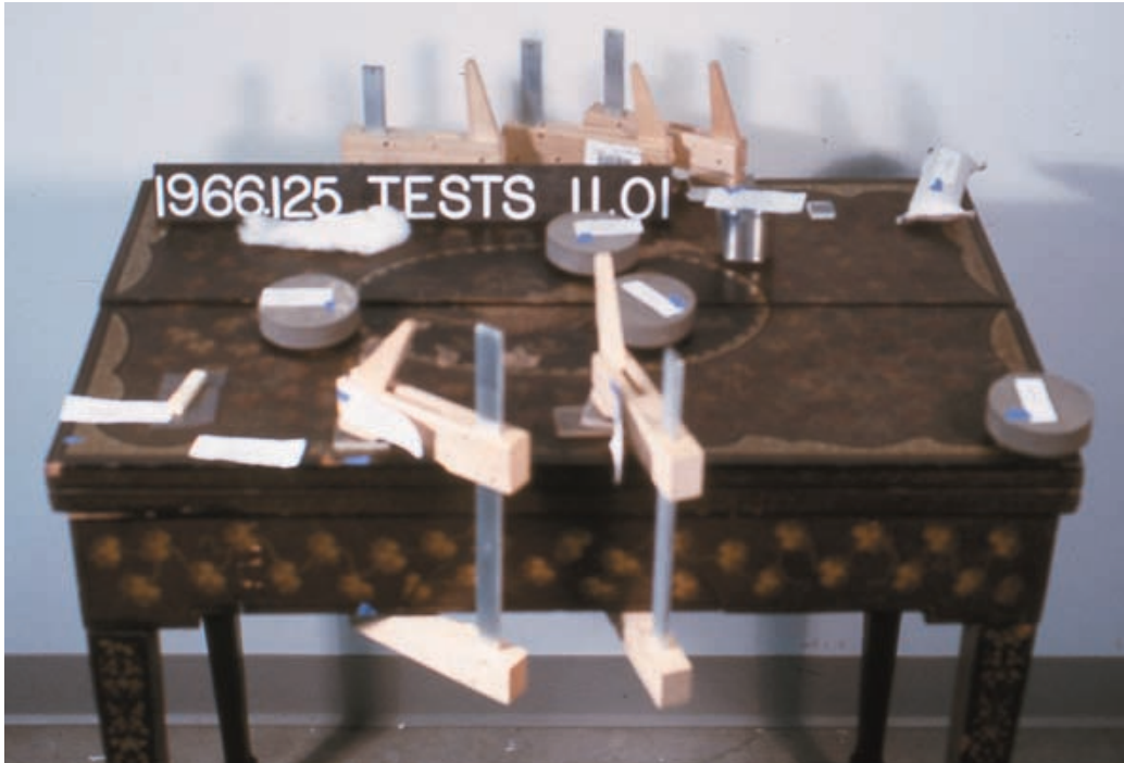
Figure 4. Consolidant testing.

solidating agent for the delaminated lacquer on this table was made with the following criteria in mind: