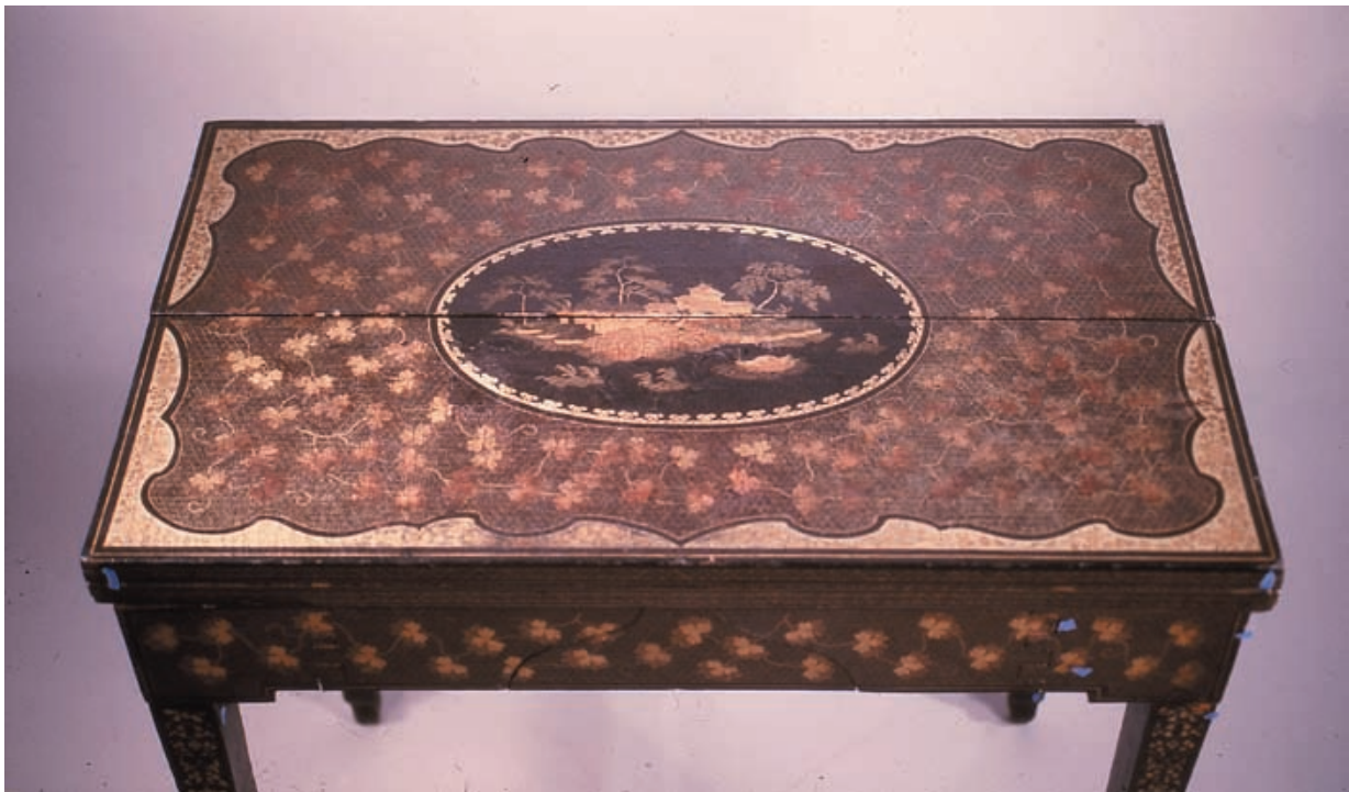
Figure 10. The top after treatment.