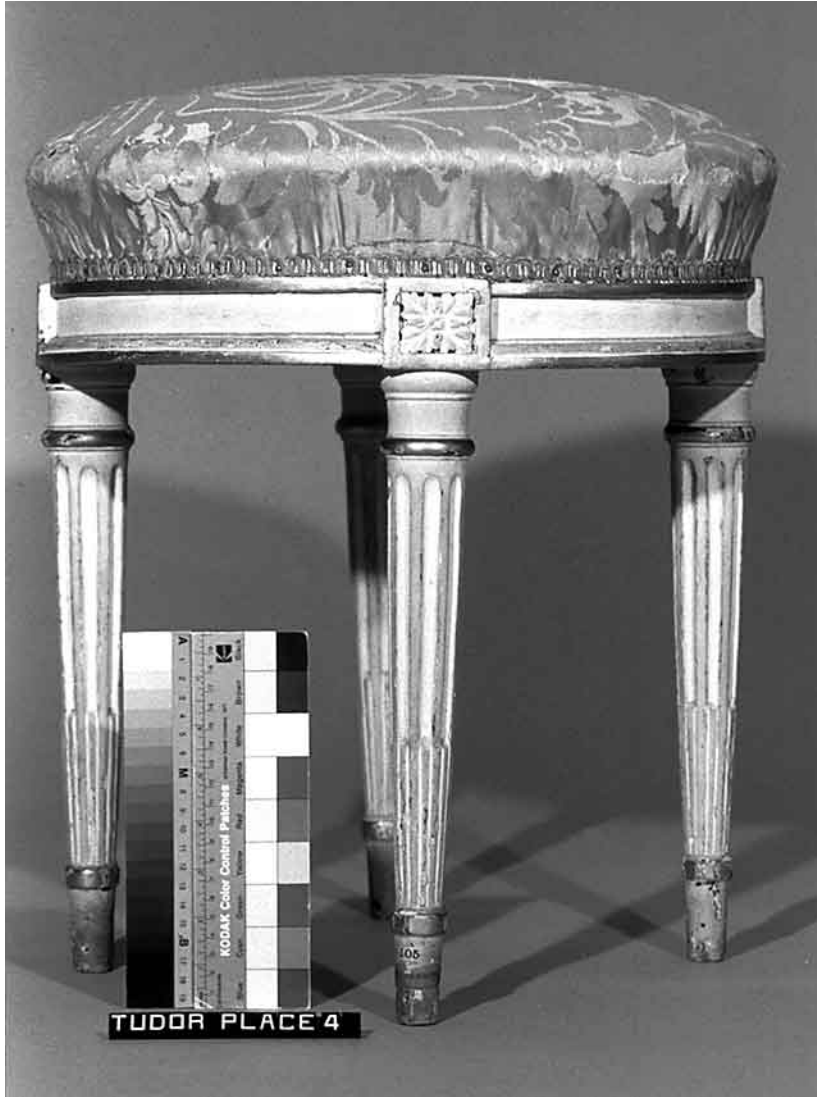
FIGURE 1 White and gold painted stool, Tudor Place.