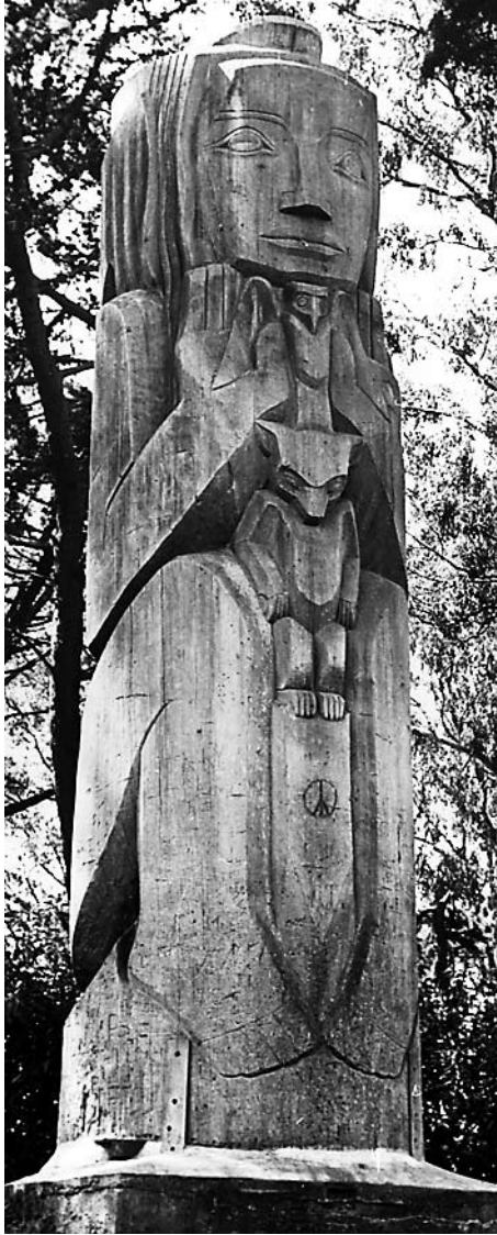
Figure 4. The Goddess of the Forest in Golden Gate Park, San Francisco, circa 1975. Its original height was roughly equal to that of a three-story house with a flat roof.

strongly against the plan. Their feeling was that somehow the sculpture should be restored in its entirety. However, considering the massive size and enormous weight of the sculpture and the very real problems involved, Dudley Carter's views prevailed. Financial and procedural questions had to be settled, but finally permission was obtained for removal of the sculpture to City College, and this was done in the summer of 1986. Dudley Carter came to City College and marked the exact locations where the sculpture was to be cut.