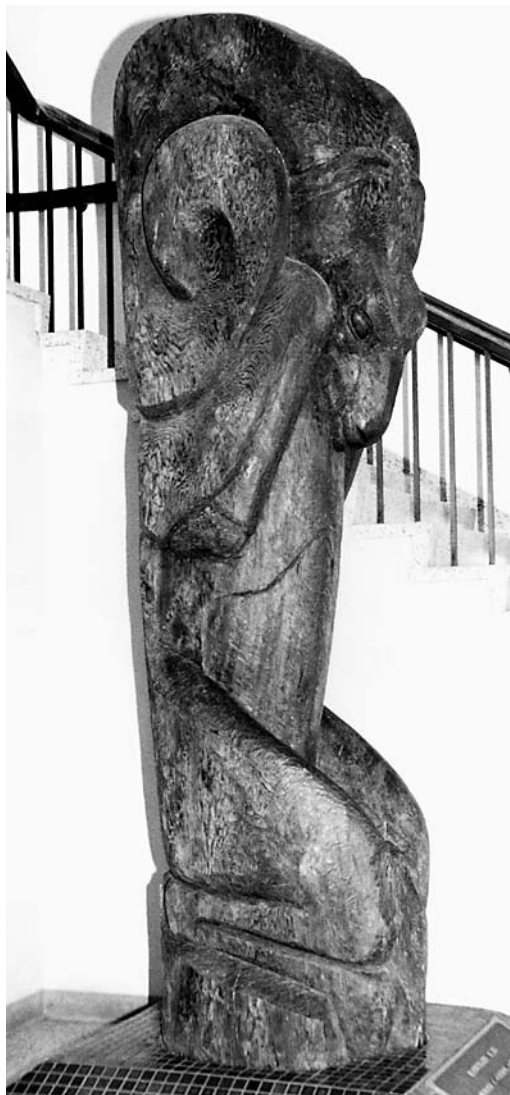
Figure 3. The Ram after its restoration.