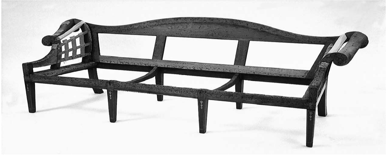
Figure 1. Sofa, Winchester, VA, c. 1790, Colonial Williamsburg Foundation, before treatment. Unusual inverted bellflower inlays decorate the legs.