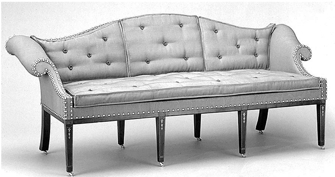
Figure 5. Sofa, Winchester, VA, overall, after treatment.

The show cloth, chosen by Ronald Hurst and Linda Baumgarten, the curators of furniture and textiles