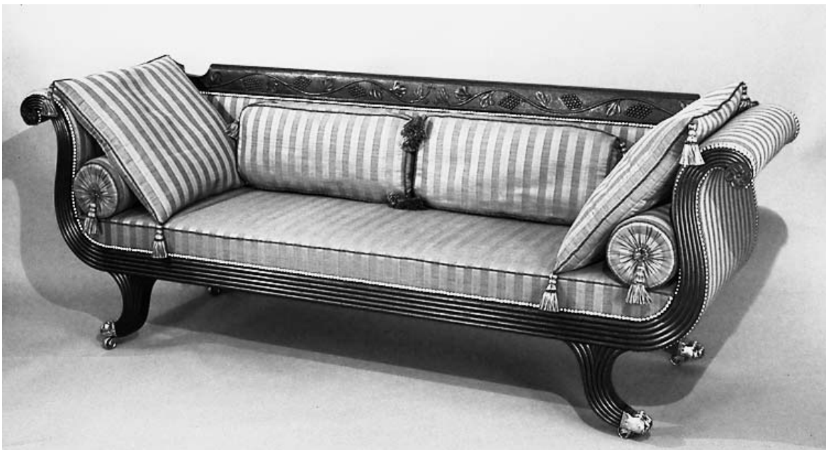
Fig. 8. Sofa, Georgetown, DC, overall, after treatment.

The skirts for the tassels were constructed by wrapping the threads around the metal straight edge. The wrapped top edge was stitched with a locking back stitch, and the threads were then removed by slitting the bottom edge. The skirts were both tied and glued into place around the wrapped wooden cores. All of the tassels were then glued and stitched to the pillows completing the treatment ( fig. 8 ).