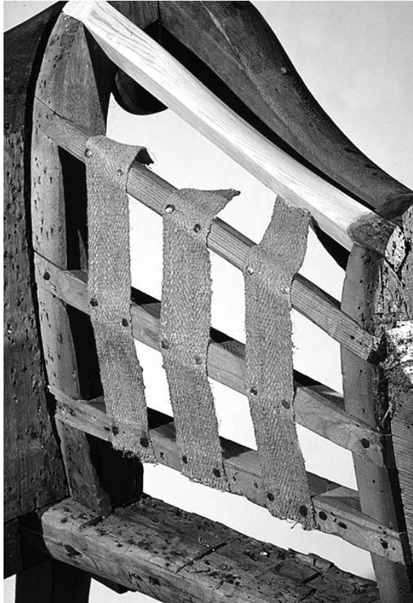
Figure 2. Sofa, Winchester, VA, detail, before treatment. The webbing on the arms is original.