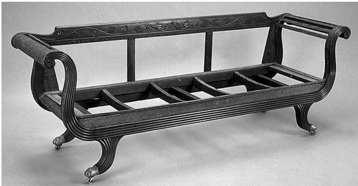
Figure 6. Sofa, Georgetown, District of Columbia, 1815-1825, Colonial Williamsburg Foundation, before treatment. An applied wood strip on the top face of the seat rails takes the place of a constructed hair roll.

The sofa arrived at Colonial Williamsburg having been completely reupholstered in 1985. The sofa