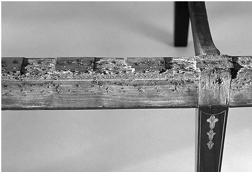
Figure 3. Sofa, Winchester, VA, detail, before treatment. Channels were cut in the top face of the seat rails to receive the webbing. Also, the webbing was nailed to the front face of the seat rail rather than doubled over on the top face.

This design is found on several of the pieces in the defined school including the legs of the sofa.