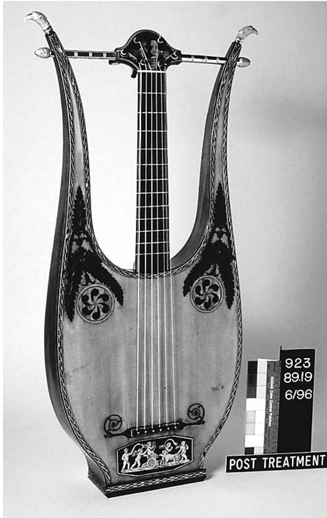
Figure 8. Instrument following treatment.