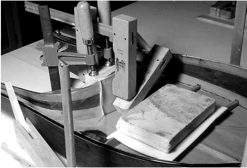
Figure 4. Neck joint with blotter and Goretex clamped to right-angle block.

object. The gaps in the braces were made using an X-acto micro saw with a kerf approximately 0.25 mm in width. In all, three discrete cuts were made in the two top braces. All of the cuts closed well, as did the splits, and were glued using hot hide glue.