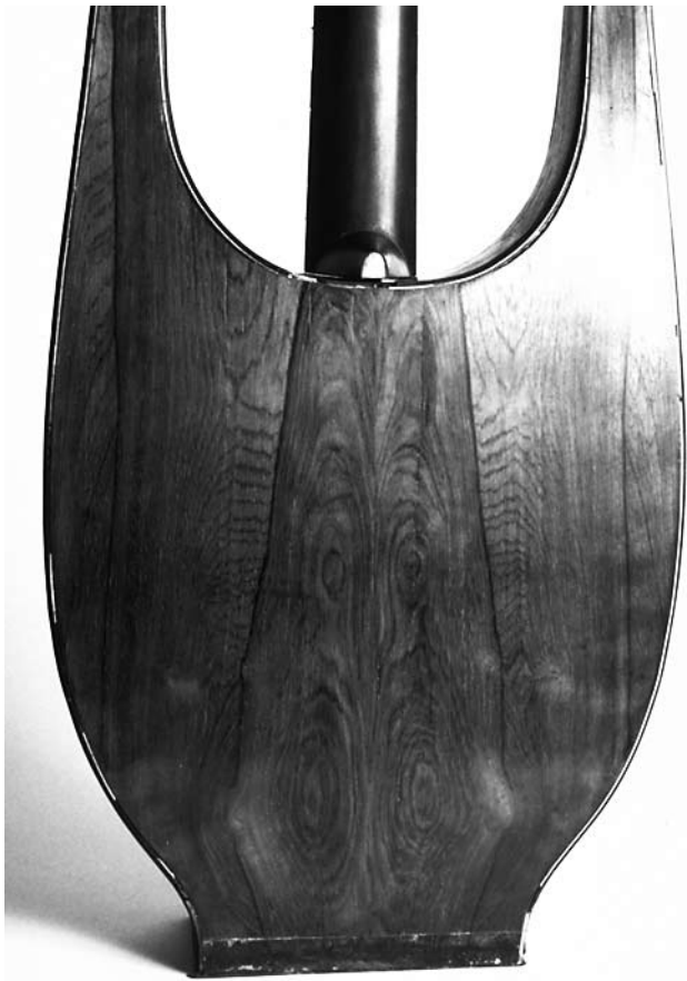
Figure 6. Back following reformation and re-attachment.

back, phase two and three steps respectively, was finished. Both top and back were cleaned using vinyl erasers, and the back was lightly coated with carnauba wax to unify the appearance of the surface.