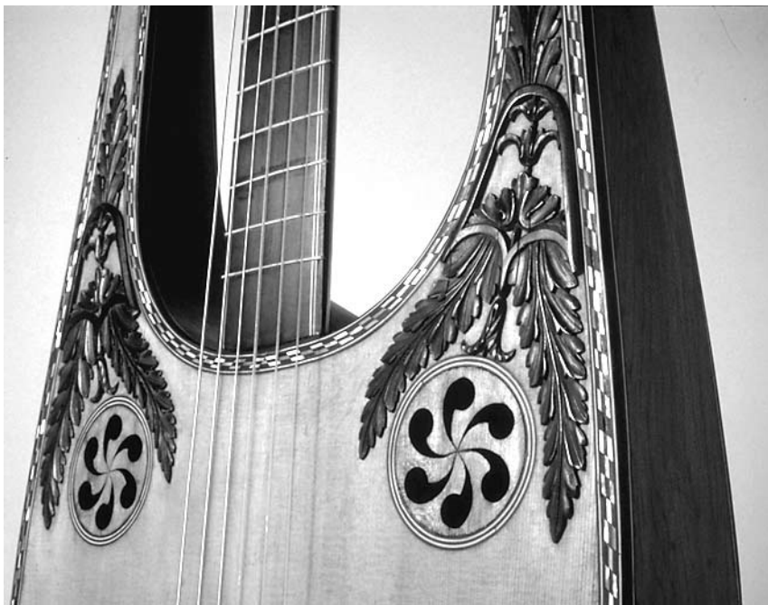
Figure 7. Detail of new roses and cast epoxy oak leaf branch (right).

to say that the instrument drawn by Ingres was also a Mareschal guitar. Peripheral research has also unearthed some tantalizing connections between the family of Lucien Bonaparte and the private Delaware collection that owns the subject of this paper. Could the instrument in the Ingres drawing and this Mareschal instrument possibly be one and the same? At this point in my research, I feel confident in saying there is indeed a possibility that this is the case.