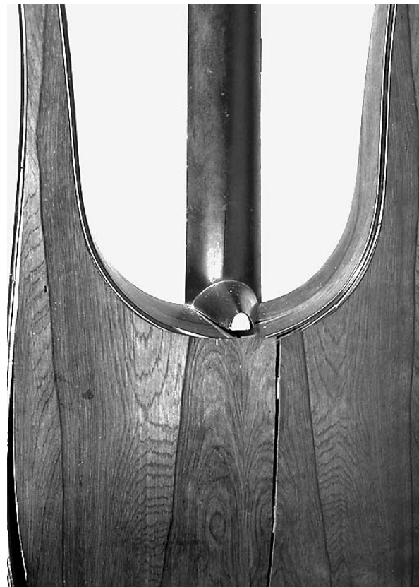
Figure 2. Back before treatment. Note failed neck and side joints, and split in back plate.

The owners of the instrument were interested in a treatment that would prevent any further deterioration as well as restore the object to an aesthetic