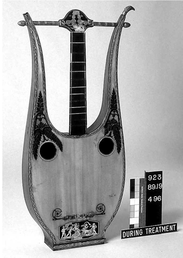
Figure 1. Instrument following structural integration and stabilization.